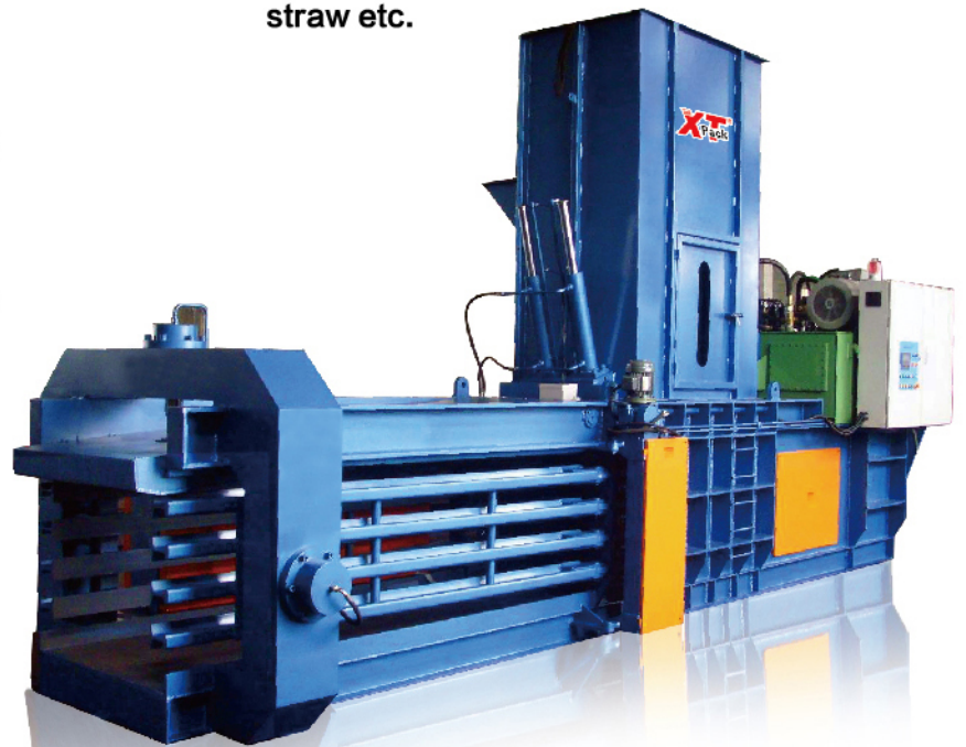
Diagram (Model XTY-1000W110110-60)